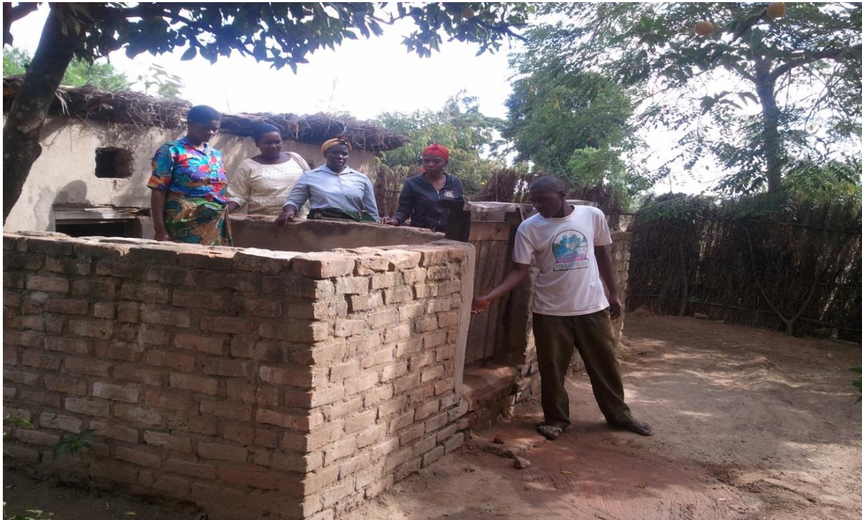
Figure 3: An example of the pig kholas being made by the women farmers in Kasungu district