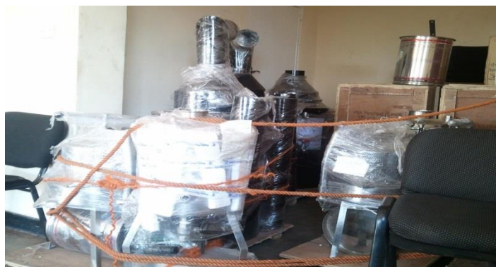
Figure 9: The machine for making soy milk and peanut butter