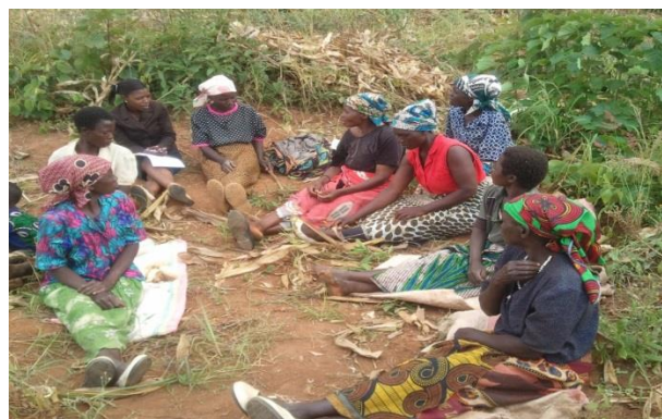
Figure 6: Focus Group Discussion in Muononga Village