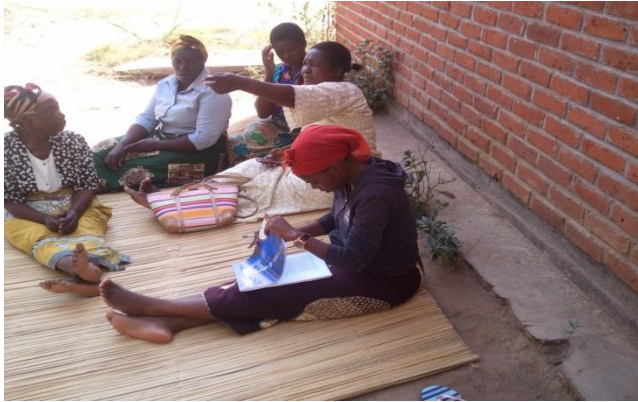
Figure 1: Focus group discussions with the women farmers in Kasungu.