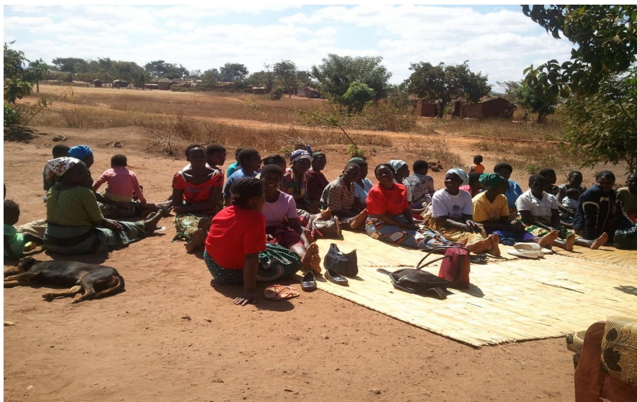
Figure 10: The focus group discussion with women farmers