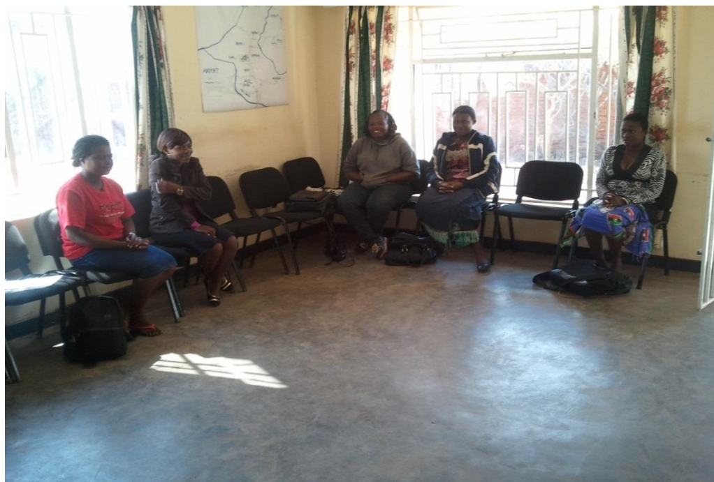
Figure 7: Focus group discussion with the DOWA female extension workers