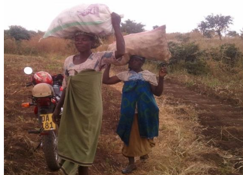
Figure 5: Women farmers transporting their crop from the field to their homes

Other benefits of the club have been exchange visits and field days to see what other women groups are doing and thus in the process, learning new things.