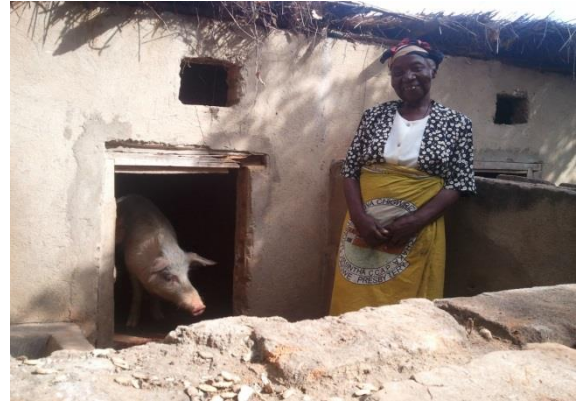
Figure 2: Farmer reaping the benefits of learning about pig production