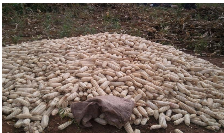
Figure 4: The maize that has been harvested by the women farmers of Dowa on their demonstration plot.

In terms of benefits that have been realized from this Programme the main ones are that of the establishment of 70 Demas for irrigation and also the practice of pit-planting for the rain fed maize that the farmers have adopted during the last rainy season. As a club they have harvested a considerable amount of maize that will be sold and the funds will be used in the implementation of other programs for the club, benefiting them a lot in their household lives.