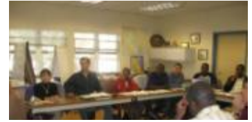
Improve adult learning by having clear learning objectives.

A Learning Objective is a statement of what the learner is expected to accomplish or acquire as a result of the class or workshop.